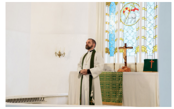
Houses of Worship