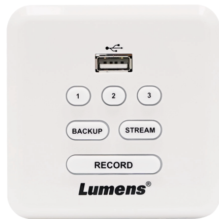
Europe standard: LC-RC01E

Lumens ® Your Success, Our Passion! www.MyLumens.com